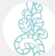
Producing tailor-made components for your projects

The creation of our new DecoPrint range has been inspired by creativity, innovation, design and concern for the environment, giving our customers a one-of-a-kind experience and realising their innovative lighting ideas in towns and shopping centres with large scale 3D printing.