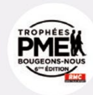
RMC "Bougeons-nous" Trophy for SMEs