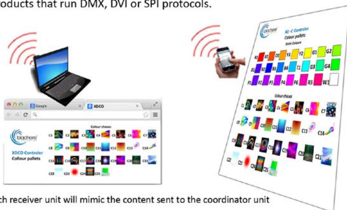
Each receiver unit will mimic the content sent to the coordinator unit

The XD-C has the same functionality as the XD-IO but with the addition of being able to send colour changing data as well. By either a text or web based interface you can easily send static colours or chase patterns at the push of a button. An ideal control solution for uplighters and other RGB LED based products. This product can communicate with products that run DMX, DVI or SPI protocols.